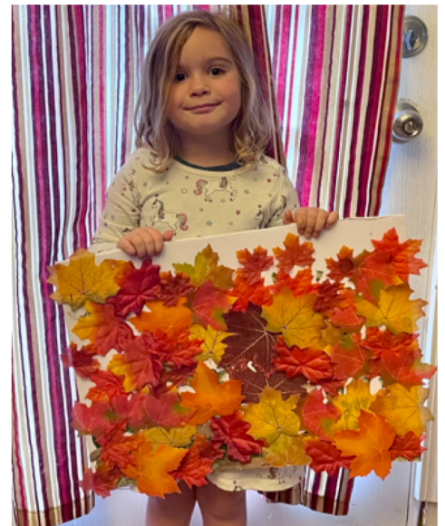
Happy Fall from Emberlee!